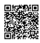
POOFIES - $200