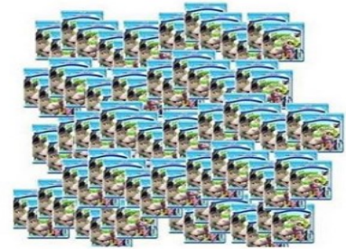
83 copies of Shrek the Third on Blu-ray 660.68$