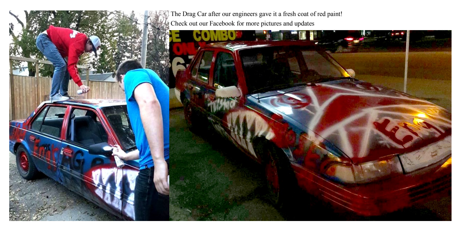
So here are some quick Dos and Don'ts about the Ag Bag Drag Car:

The Ag Bag Drag car is a piece of trash car that Agriculture students buy each year for a few hundred dollars. The car is required to drive around Saskatoon every day to be open for Engineers to steal. This age-old tradition ends with the Ag Bag Drag party hosted by the Ags, where they destroy the (hopefully red) car. Though we have the car for now, be on the lookout until the 27<sup>th</sup> as the Ag students may have stolen it back from us.